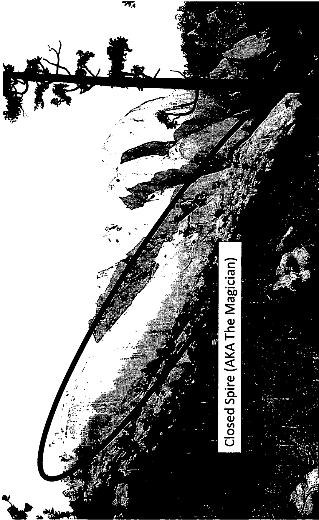
Closed Spire (AKA The Magician)